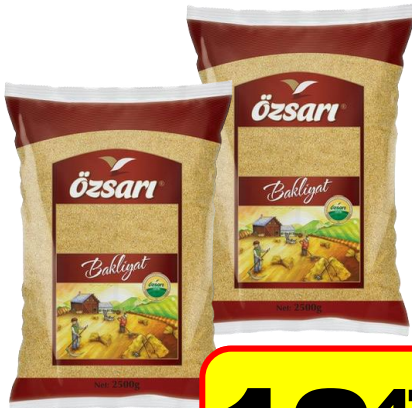
Ozsari Bulgur White Fine #1 Each. 5 kg.