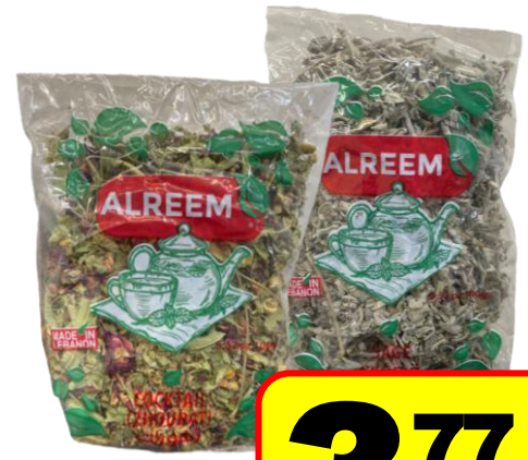
Alreem Zhourat or Sage Each. 100 g.