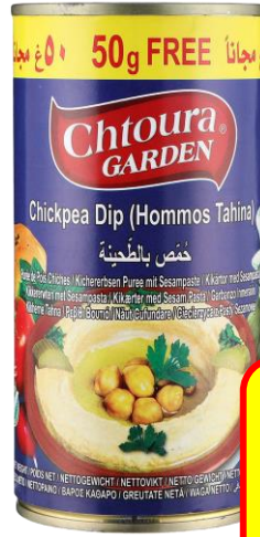
Chtoura Garden Chickpea Dip Each. 430 g.