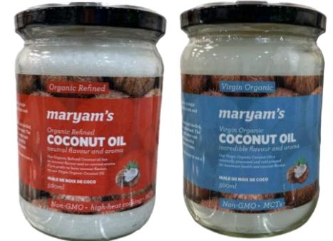
Maryams Coconut Oil Organic Each. 500 mL.