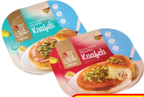
Aghati Knafeh Naabulsiya Fine or Shredded Each. 200 g. Frozen.