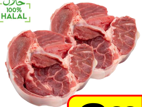
Boneless Beef Shanks Product of Alberta. 15.14/kg.