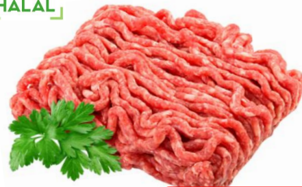
Ground Beef & Lamb Mix Product of Alberta. 19.10/kg.