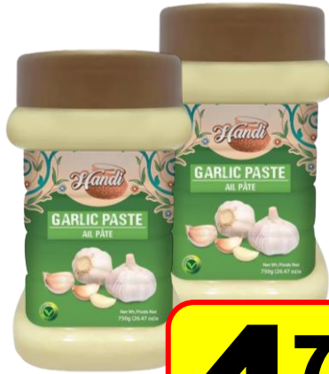
Handi Garlic Paste Each. 750 g.