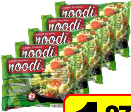
Noodi Instant Noodles Veggie Each. 5 x 70 g.