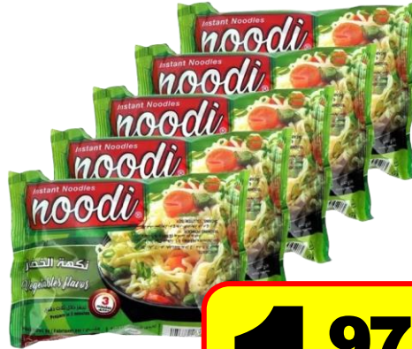
Noodi Vegetable Instant Noodles Each. 5 x 70 g.