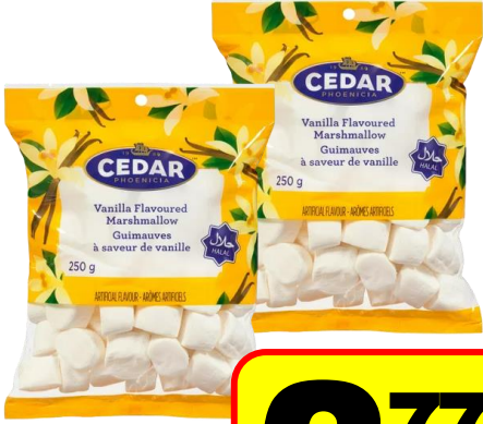
Cedar Vanilla Marshmallows Each. 250 g.