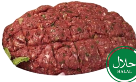
Lebanese Beef Kafta Prepared in Store. 17.56/kg.