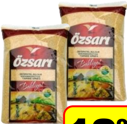
Ozsari Bulgur White #1 Each. 5 kg.