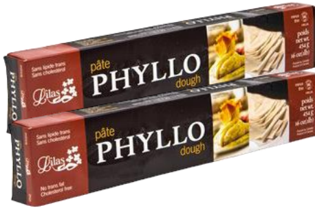
Lilas Phyllo Wrappers Each. 454 g. Frozen.