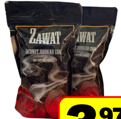
Zawat Coconut Charcoal Each. 500 g.