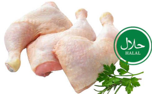
Chicken Legs Back Attached Prepared of Canada. 7.22/kg.