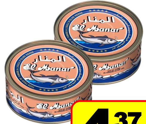
Elmanar Tuna in Olive Oil Each. 160 g.