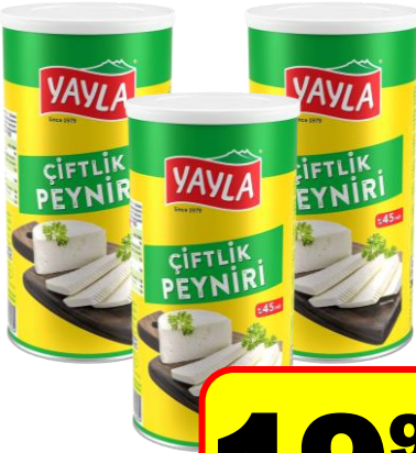
Yayla White Cheese 45% Each. 800 g.