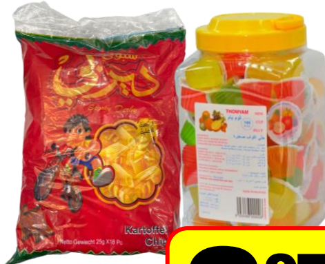
Derby Chips or Thomyam Mini Jelly Cups Tub Each. 18 pk - 100 pk.