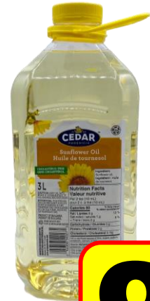
Cedar Sunflower Oil Each. 3 L.