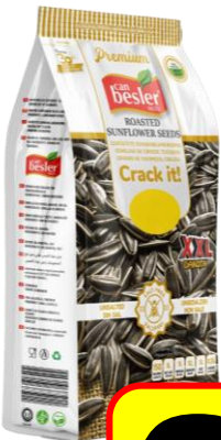
Besler XXL Sunflower Seeds Unsalted Each. 256 g.