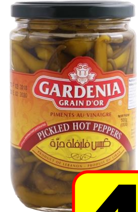
Gardenia Hot Peppers Each. 500 mL.