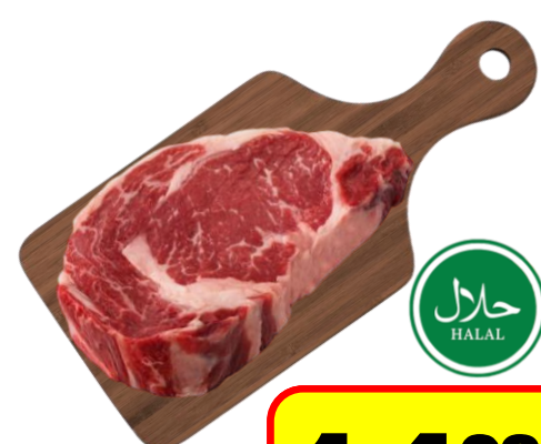
AA+ Ribeye Steaks Product of Alberta. 33.03/kg.