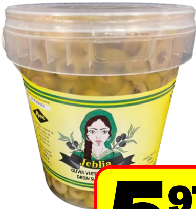
Jebbia Olives (All Flavours) Each. 940 g.