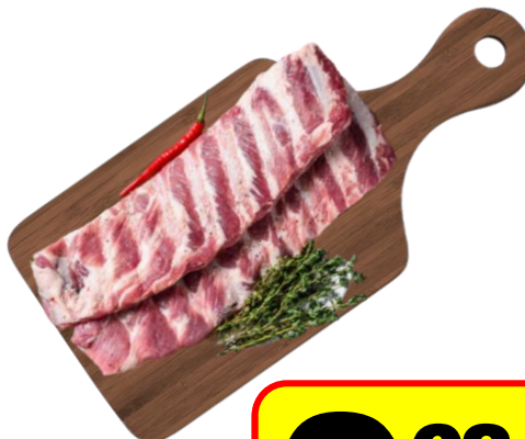
Premium Lamb Ribs Product of Alberta. 21.34/kg.