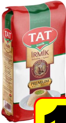
Tat Irmik Semolina Each. 500 g.