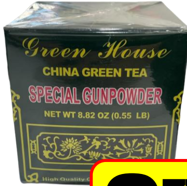
Special Gunpowder Green Tea Each. 250 g.